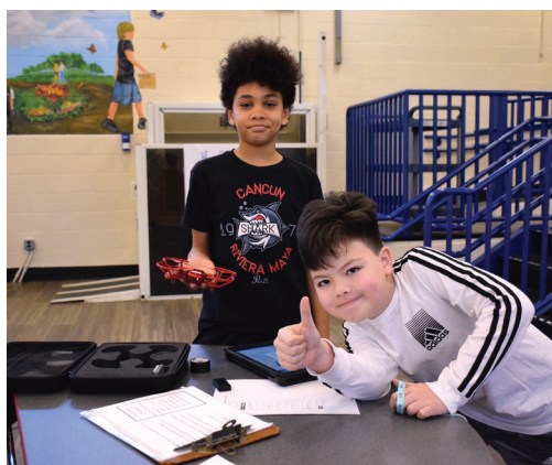
Fifth graders at Chatterton collaborated to code the school's new Tello drones.