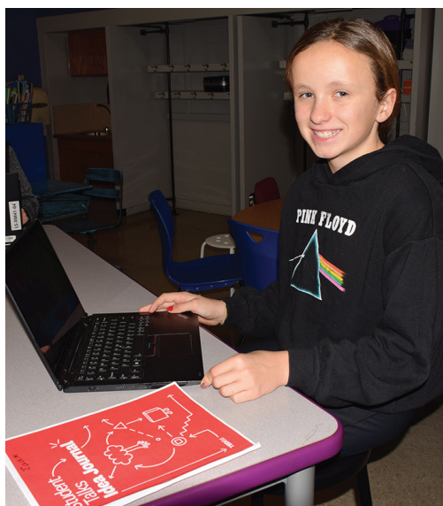
The TED-Ed Club at Lakeside is modeled after the popular TED Talks series of online discussions of ideas.