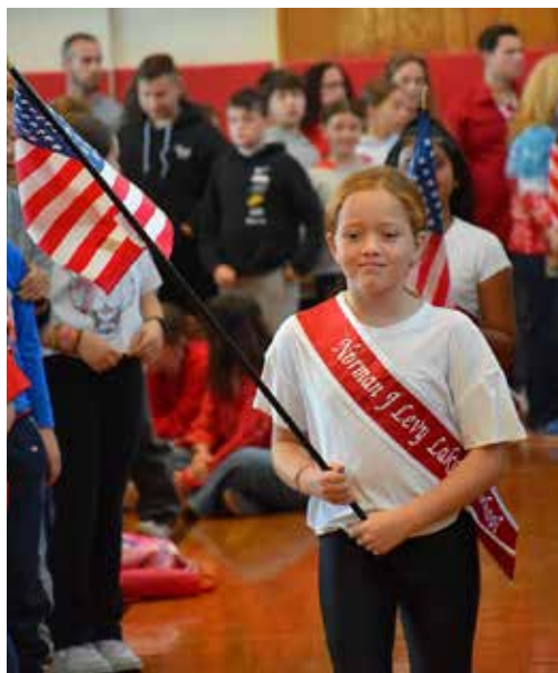
The annual Veterans Day ceremony hosted at Lakeside opened with the school's color guard presenting the flags.