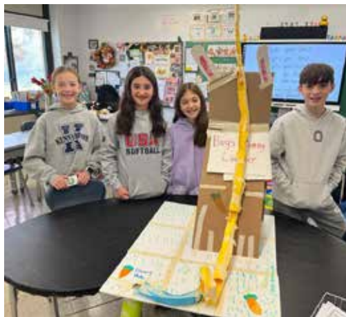
During science enrichment at Birch, sixth graders put their engineering skills to the test to create roller coasters.