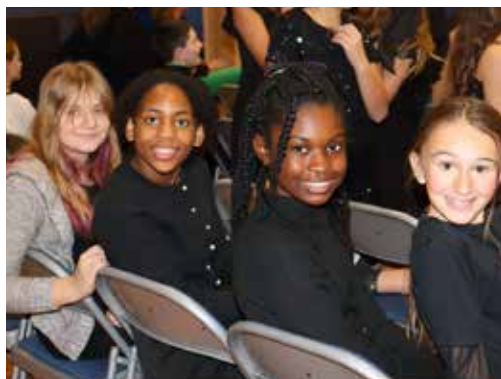
Students at Chatterton performed their winter concert in December after months of preparation.